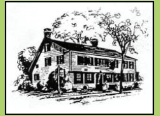
The Allis-Bushnell House ca. 1785 is listed on the National Register of Historic Places.

To make appointments for Allis-Bushnell House tours call (203) 245-4567